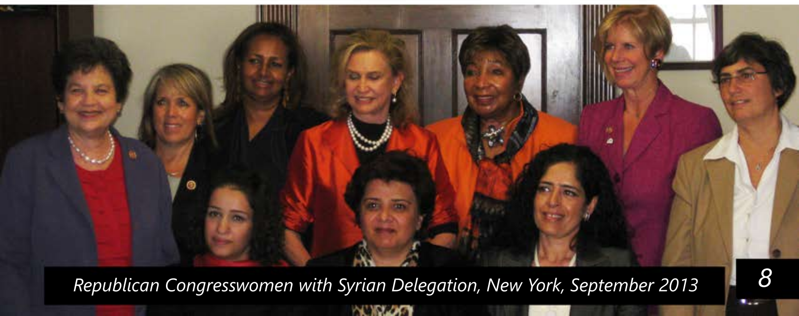
Republican Congresswomen with Syrian Delegation, New York, September 2013

In the midst of the crisis over chemical weapons, Donor Direct Action with support from the NoVo Foundation brought a delegation of the Syrian Women's Forum for Peace to New York and Washington, DC in September 2013 to meet with UN and US officials, women leaders in the United States, and the media. The group was formed in 2012, following a meeting of Syrian women in Cairo convened by Karama, a regional network of women's groups in the Middle East working to build women's leadership. The Syrian Women's Forum for Peace is working for a peaceful political transition to democracy in Syria and building a broad-based coalition of Syrian women across the political spectrum. Donor Direct Action facilitated meetings for the delegation with the Special Representative of the UN Secretary-General on Sexual Violence in Conflict , the US Under-Secretary of State for Global Women's Affairs , members of Congress , and the editorial board of the New York Times .