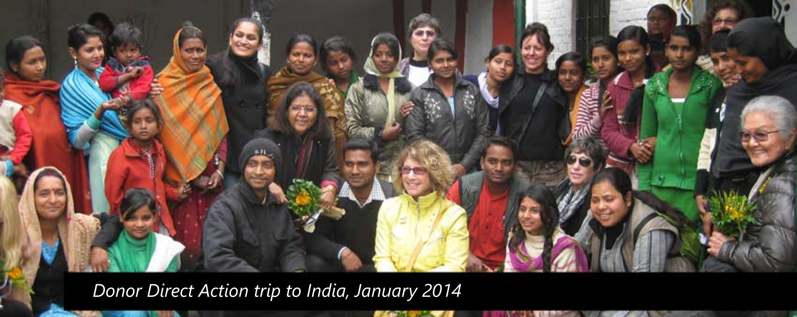
Donor Direct Action trip to India, January 2014

The group of supporters met with sex trade survivors and walked through the “red light” district of Sonagachi, learning about the cycle of sex trafficking and the inter-generational challenges of stopping this cycle. Through participant contributions the visit raised $50,000 to support the work of Apne Aap.