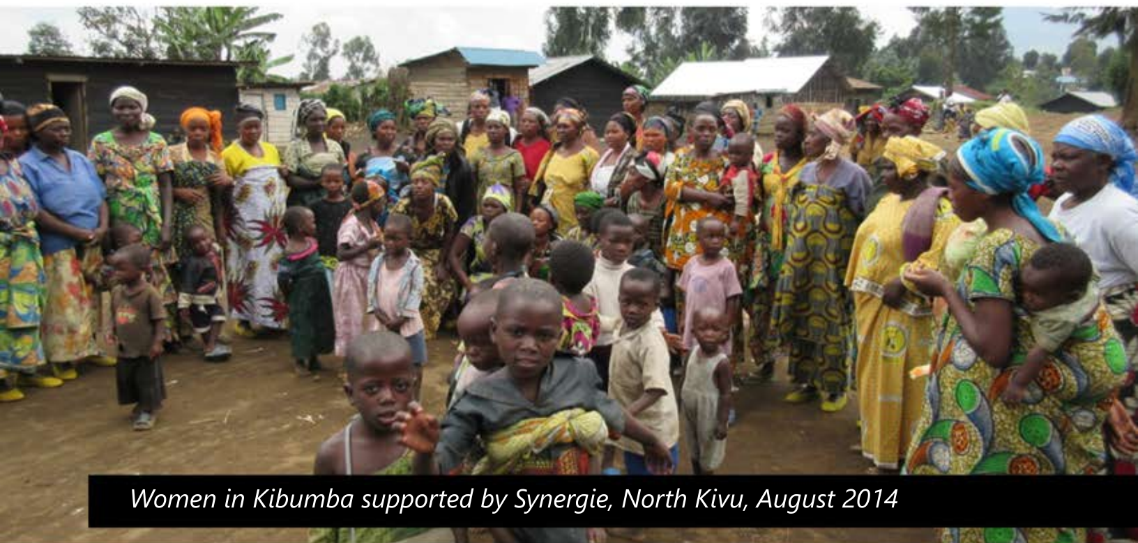
Women in Kibumba supported by Synergie, North Kivu, August 2014