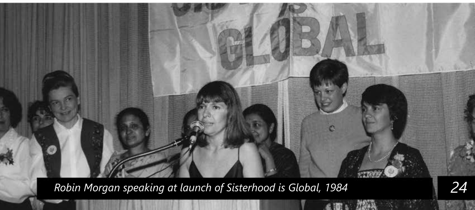
Robin Morgan speaking at launch of Sisterhood is Global, 1984