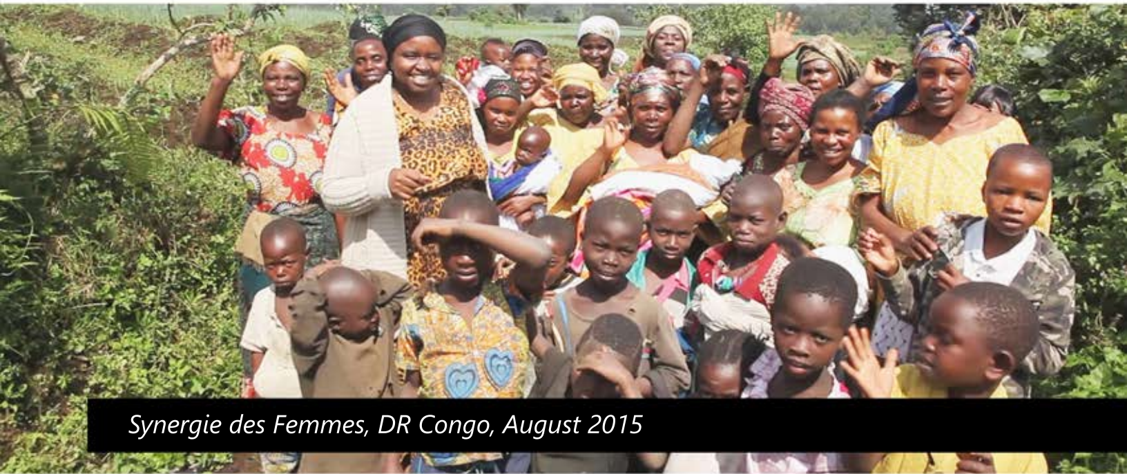
Synergie des Femmes, DR Congo, August 2015

11,095 people, including 6,923 women and 4,172 men , attended screenings of the film, which highlights the role of women in Liberia who came together to end the war. The film and subsequent local discussions inspired many to become agents of change in their communities.