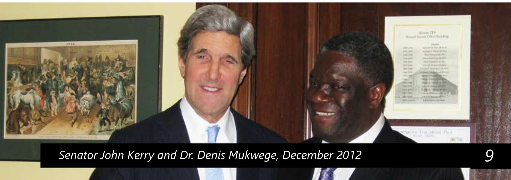
Senator John Kerry and Dr. Denis Mukwege, December 2012

Panzi Foundation continues to support and supplement the work of Panzi Hospital, which has treated over 25,000 women for gynecological conditions under the supervision of Medical Director Dr. Denis Mukwege. Many of these women and girls – and in some cases even infants – have been subjected to severe sexual violence. In addition to raising funds to support Panzi Foundation, Donor Direct Action has also supported Dr. Denis Mukwege in his advocacy efforts to ensure that the voices of Congolese women are heard at the international level and included in policy discussions. DDA facilitated meetings with President Bill Clinton , Senator John Kerry , philanthropist George Soros and Nicholas Kristof of the New York Times .