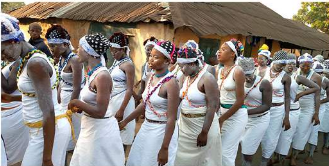
Girls undergo an Alternative Rite of Passage organized by Amazonian Initiative Movement (AIM) in Sierra Leone, in December 2019.

On January 2019, Sierra Leone banned FGM. With nine in ten girls being subjected to FGM there is much need for community awareness about the harms of FGM in Sierra Leone. In December 2019, the Amazonian Initiative Movement (AIM) organized a mass-based Alternative Rite of Passage for about 100 girls who went through the Bondo without the cut. The event raised much awareness within the community about culturally appropriate and safe alternatives to FGM.