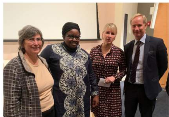
(Left to Right) Jessica Neuwirth, Justine Masika Bi-hamba (Synergie des Femmes, DR Congo), Margot Wallström (former Foreign Minister of Sweden) and Swedish UN Ambassador Olof Skoog at the New York premiere screening of the film Feminister on October 29, 2019 highlighting the feminist foreign policy developed by Wallström.