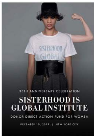
Dior's Sisterhood Is Global T-shirt, inspired by Robin Morgan's work