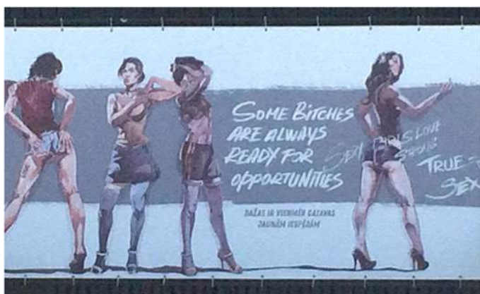
A banner in a series of advertisements by the Ghetto Games in Latvia.