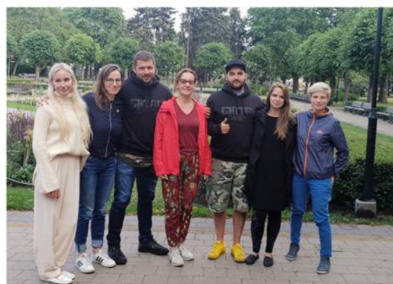
Representatives of MARTA Center met with Ghetto Games staff in July, 2019.

In July 2019, the "Ghetto Games," a street sports event for young people in a Riga suburb of Latvia produced a series of posters aimed at young men with pictures of submissive and sexualized women referring to them as "bitches." MARTA Center , a leading Latvian women's rights organization that works against domestic violence and sex trafficking, spearheaded a campaign to shut down these extremely misogynistic advertisements.