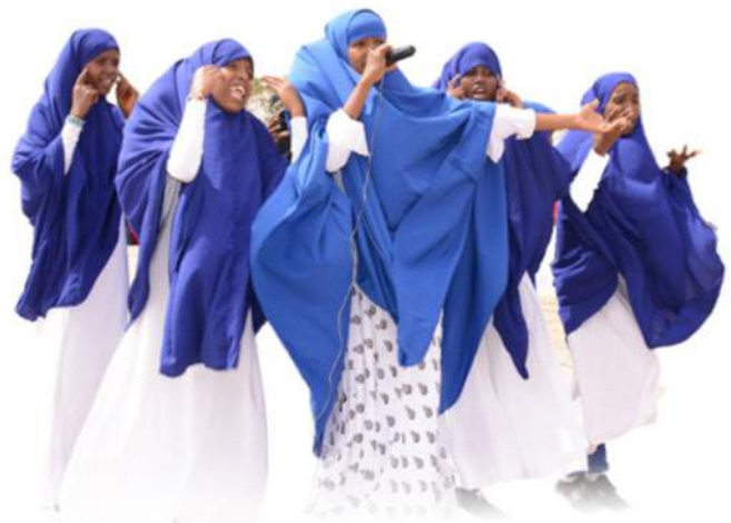
Girls participate in an empowerment camp organized by Galkayo Education Center for Peace and Development (GECPD) in Somalia, in the summer of 2019.

In the summer of 2019, Galkayo Education Center for Peace and Development (GECPD) organized summer educational programs and activities for children from different communities. Activities included sports for confidence-building and workshops on the physical, psychological, social, and sexual harms caused by FGM. Each year over 2000 girls and women benefit from the programs of GECPD.