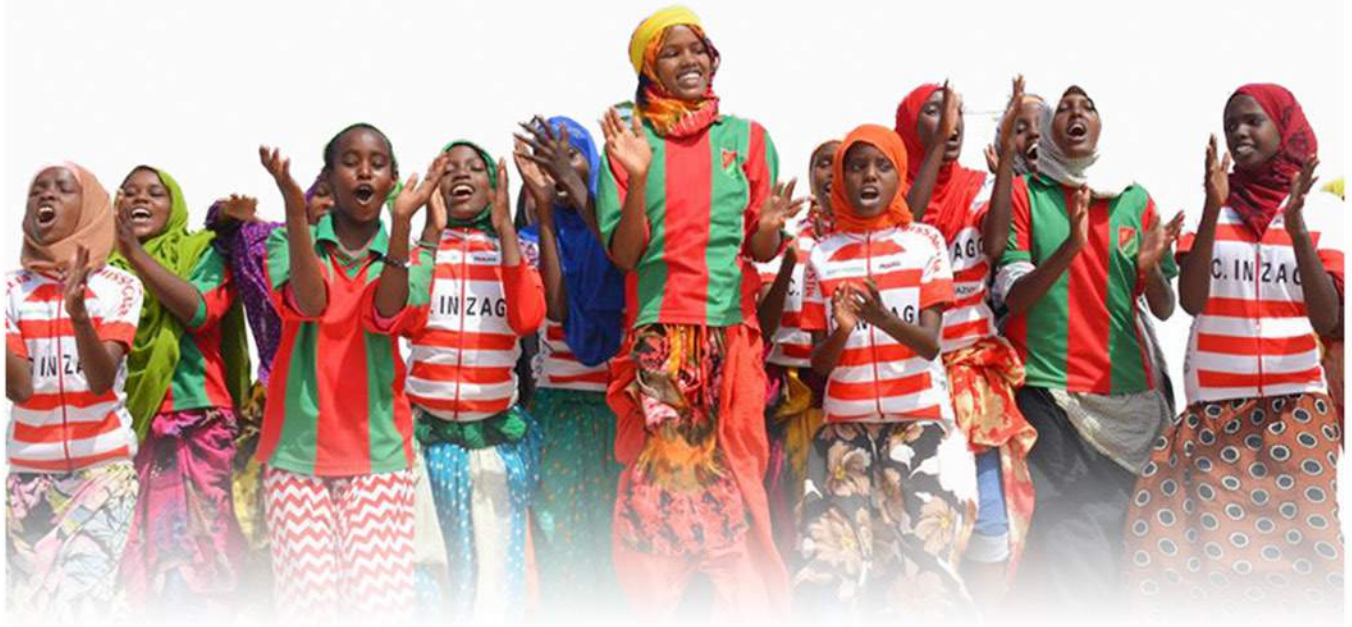
Girls participate in a sports camp organized by the Galkayo Education Center for Peace and Development (GECPD) in Somalia.

The outbreak of COVID-19 has disproportionately affected marginalized people around the world susceptible to the virus, and lock-downs have left them unable to access health care or food. The gendered-impact of COVID-19 is manifest in the large number of women in the informal sector who are now unemployed. And women have quietly shouldered the exponential increase in home-based care while domestic violence hotlines have recorded notably high numbers of cases during the lock-down. Sheltering at home has increased the risk of abuse for women while decreasing their access to protection.