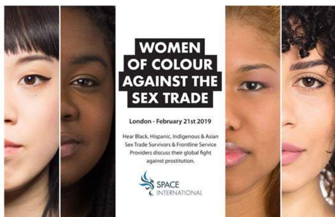
In 2019 SPACE International organized two events – in London and New York - that highlighted the voices of women of color who are survivors of the sex trade. This poster promoted the event in London in February 2019.

In an effort to build the abolitionist movement across Africa, Embrace Dignity serves as the secretariat for the Coalition Abolition of Prostitution in Africa (CAPA). In 2019 the CAPA Charter was launched with 350 signatories.