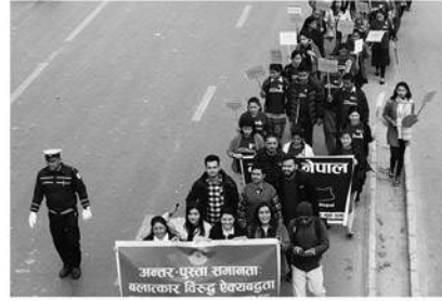
Nepalis march against rape in a rally organized by FWLD.

In April 2019, the Forum for Women, Law and Development (FWLD) in Nepal took on the case of a 14-year old school girl who was raped by a school worker. The school principal who was also a friend of the perpetrator and knew about the incident did not report it to the police.