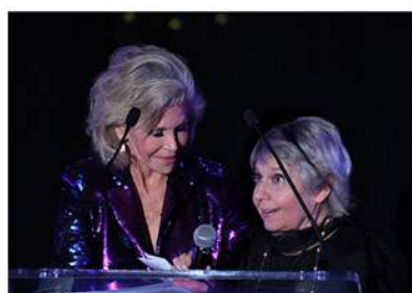
Award-winning actor and activist Jane Fonda honors author and SIGI co-founder Robin Morgan