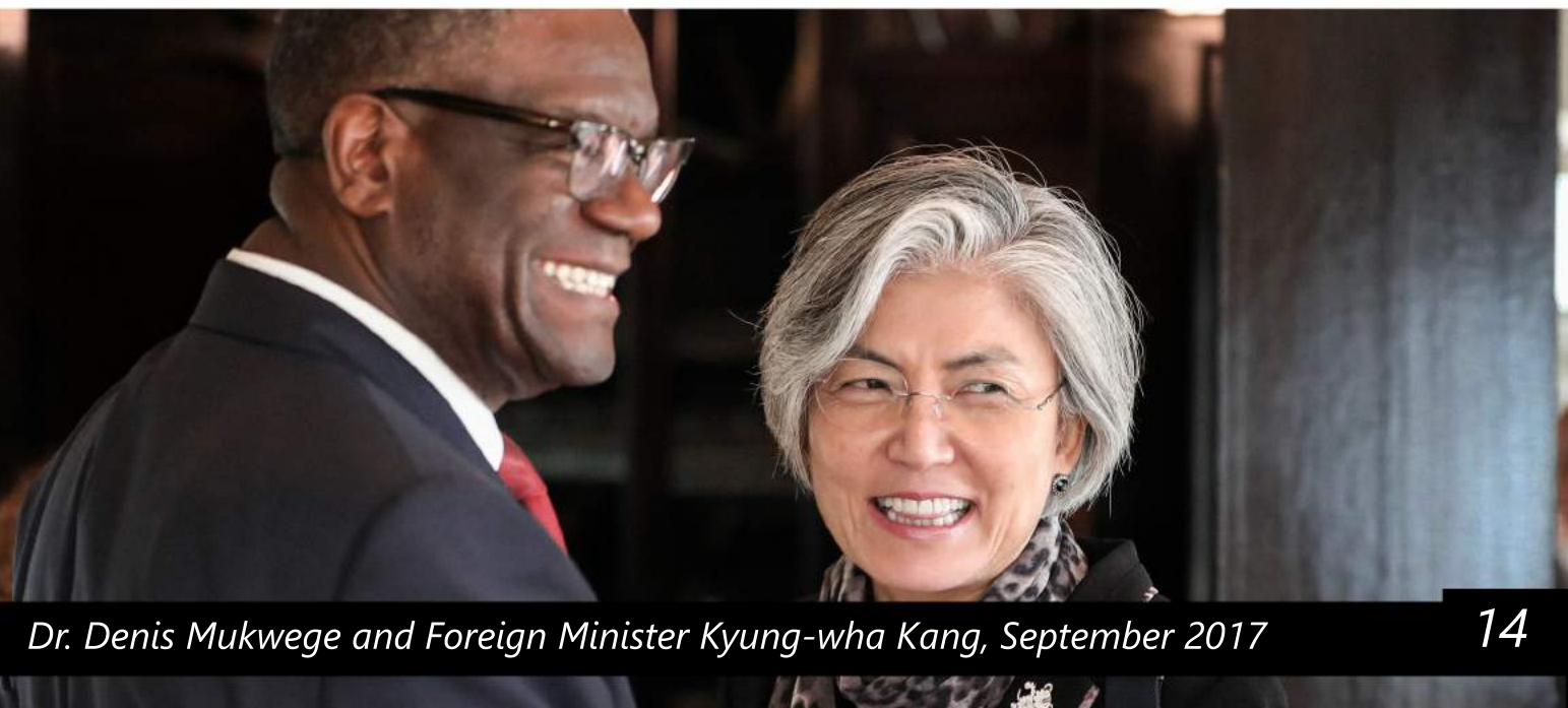
Dr. Denis Mukwege and Foreign Minister Kyung-wha Kang, September 2017