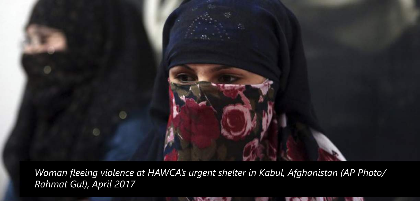
Woman fleeing violence at HAWCA's urgent shelter in Kabul, Afghanistan, April 2017