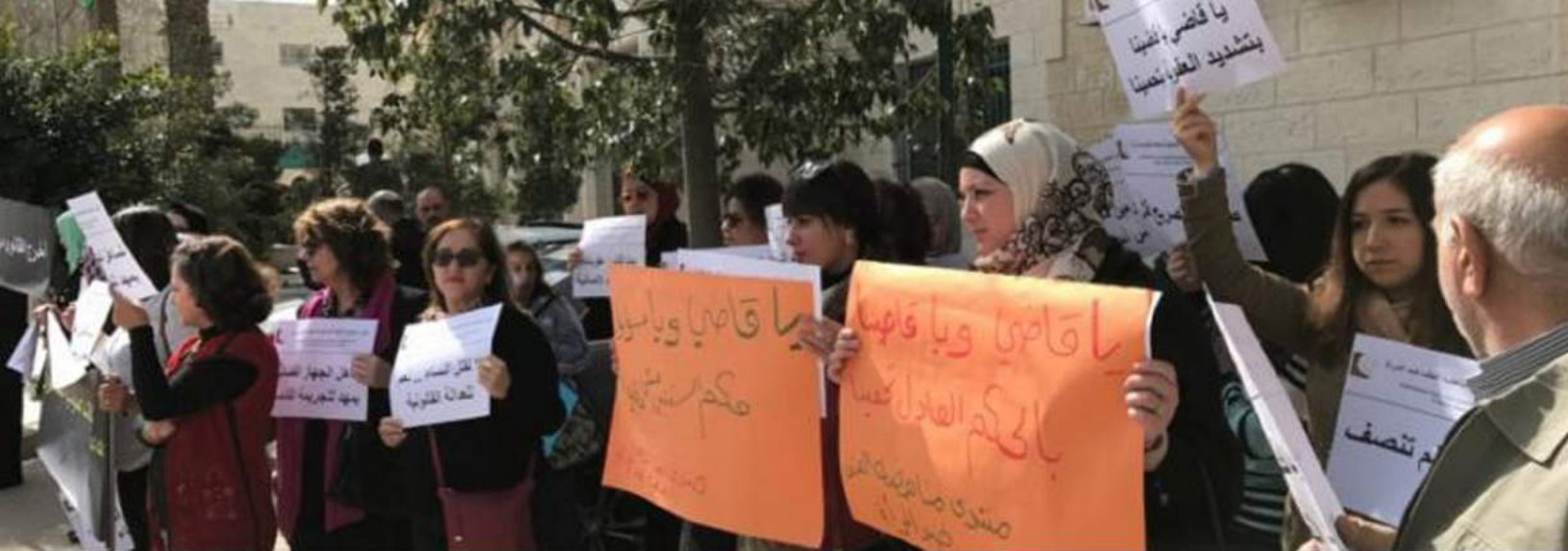
WCLAC protests at appeals court in Ramallah, Palestine, April 2017

that the growing momentum will help in their push for urgent changes to Palestine's outdated Penal Code, which has enabled murderers to get reduced sentences for far too long. In 2017 WCLAC tracked 27 cases of femicide in Palestine.