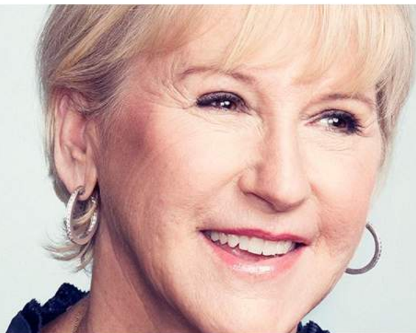
Swedish Foreign Minister Margot Wallström

Donor Direct Action organized a dinner for Swedish Foreign Minister Margot Wallström to meet with some of our allies who work on ending commercial sexual exploitation and sex trafficking including the Coalition Against Trafficking In Women (CATW), Sanctuary For Families and Apne Aap, together with women working in the French, Swiss and Swedish missions to the UN.