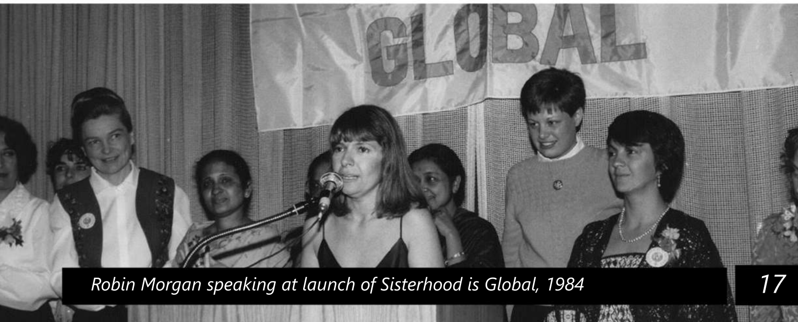
Robin Morgan speaking at launch of Sisterhood is Global, 1984