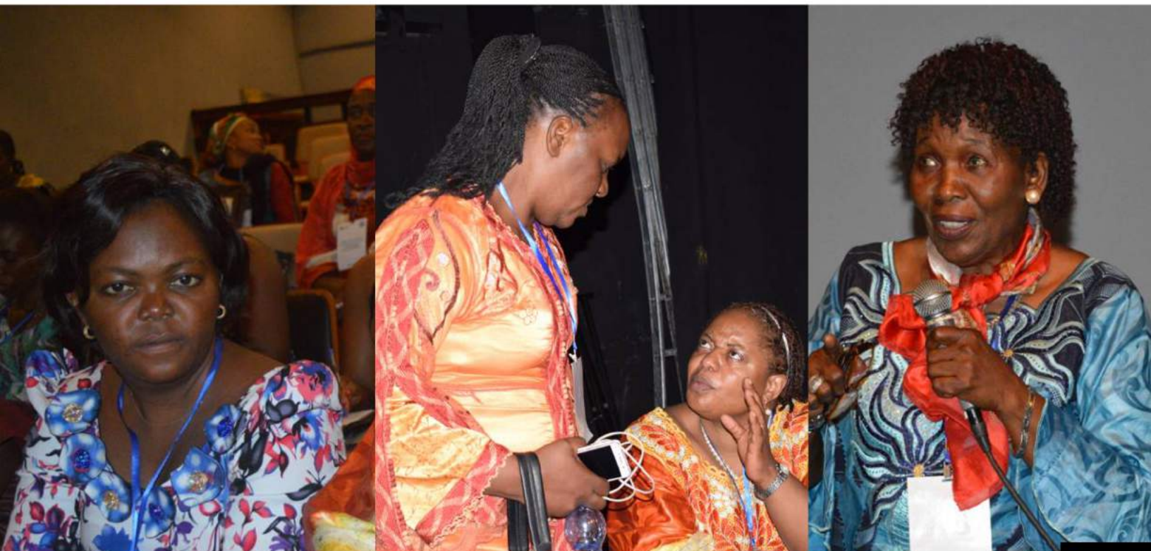
Participants at the Congolese Women's Forum in Kinshasa, September 2017

Lena Dunham , Liberian Nobel Prize laureate Leymah Gbowee , former UN High Commissioner for Human Rights Navi Pillay , Gloria Steinem , Meryl Streep and Swedish Foreign Minister Margot Wallström joined the Forum from various locations around the world. Supported with promotion from Facebook this global convening was seen online by over 640,000 viewers and shared by thousands.